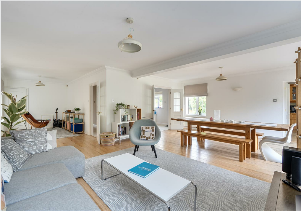
A charming detached chalet-style bungalow offering flexible 5 bedroom accommodation spread over two floors, with off-street parking, garage and delightful, private gardens of approx 0.35 acres.