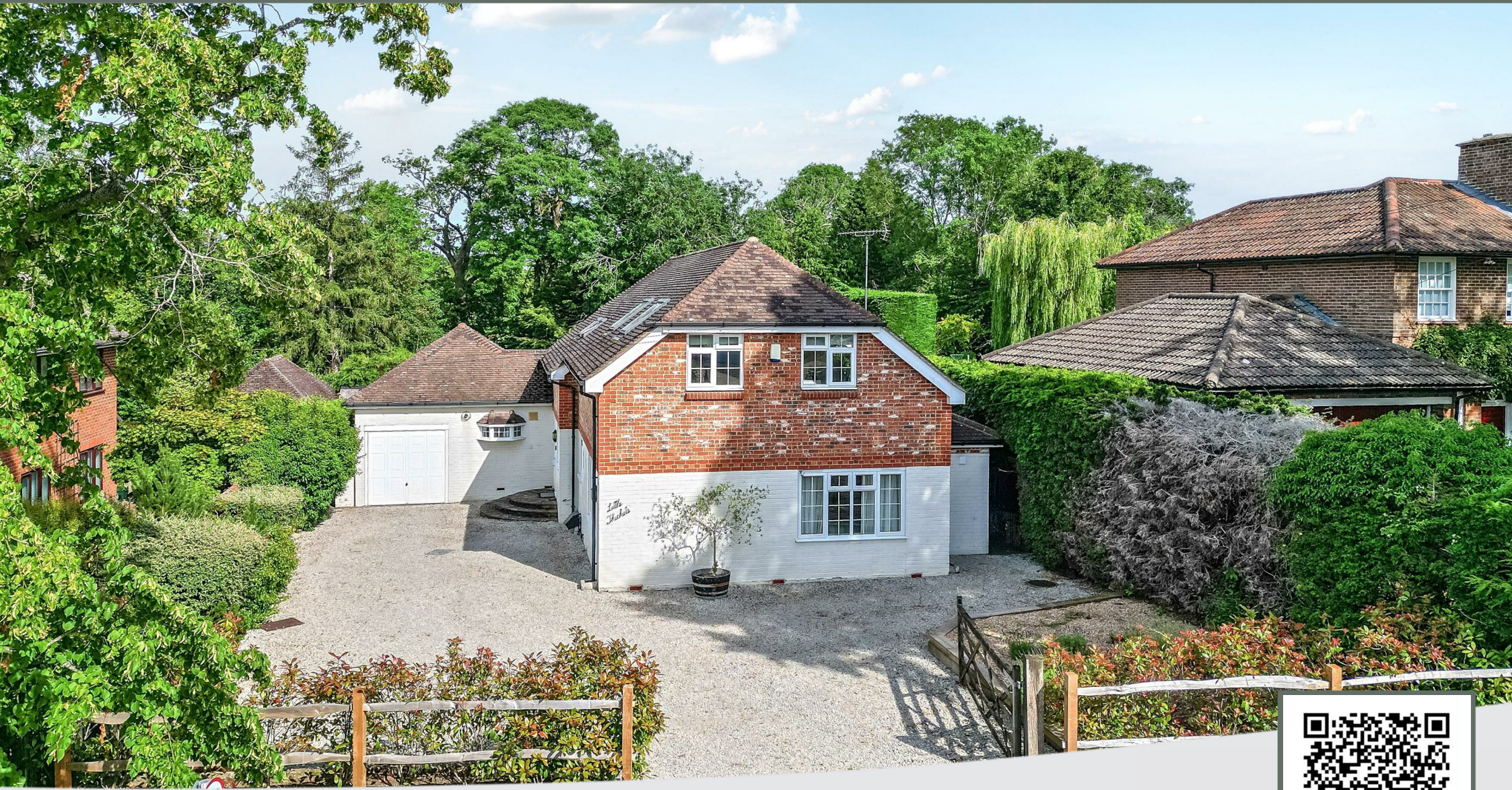
Little Thickets, Forest Road East Horsley, Surrey KT24 5BT